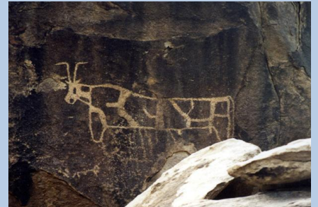
Etching of Egyptian style cattle on one of the boulders that form what is believed to be the Golden Calf altar.