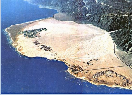
The beach at Nuweiba where the children of Israel crossed the Red Sea.