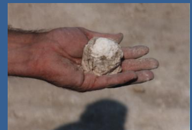
Brimstone from the ash remains of Gomorrah.