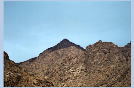
The blackened peak of the real Mount Sinai located in Saudi Arabia, scorched by the presence of God.