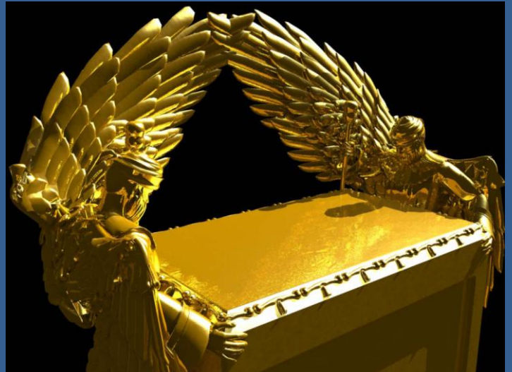
This is an artist's rendering of the Ark of the Covenant based on eyewitness testimony from 1982. Come hear the story of the excavation and experiences that led to the discovery.

Seating is limited, Please RSVP Call (540) 239-7254 Or email rsvp@anchorstone.com